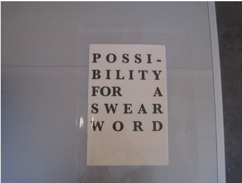
Jon Bocksel's clever conceptual print brings many four letter words to mind.